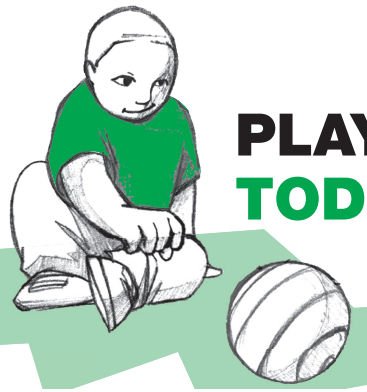
Illustration by Billy Nuñez, age 16